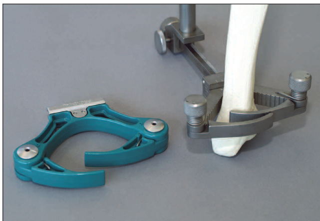
Figure 3. This ankle clamp designed by John Grecco of Stryker Orthopaedics attaches the plastic yoke to a metal component that interacts with the rest of the instrument.

might trap contaminants from the surgical procedure. Work with the metal supplier and molding vendor to determine a feature in the metal that will hold the TPE resin in place so that it can't pull away and leave a gap.