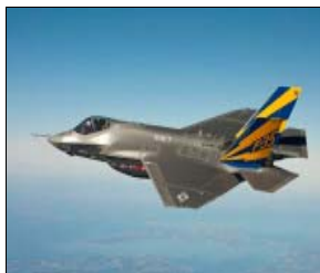
Burlington City Council delays taking up F-35 resolution

NEWS CONFERENCE ON VERMONT HEALTH CONNECT