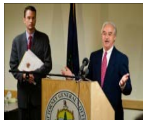
New access to criminal investigation records assessed by lawmakers